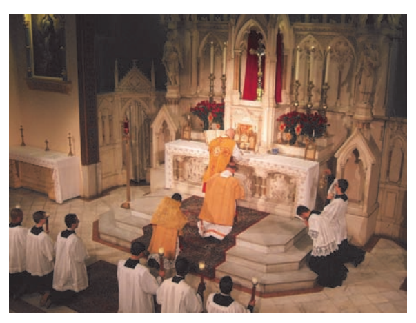
Traditional Latin Mass is celebrated at Holy Innocents every day of the week: Mon-Fri 6 pm, Saturday 1 pm, Sunday 10:30 am