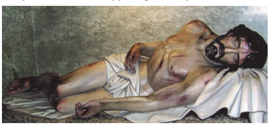
Jesus in the Sepulchre